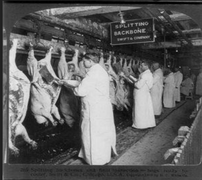
265 Splitting machines, and final inspection - hogs, ready to cool, Swift & Co., Chicago, U.S.A.

Sinclair's book led the government to pass the Meat Inspection Act, and the Pure Food and Drug Act!