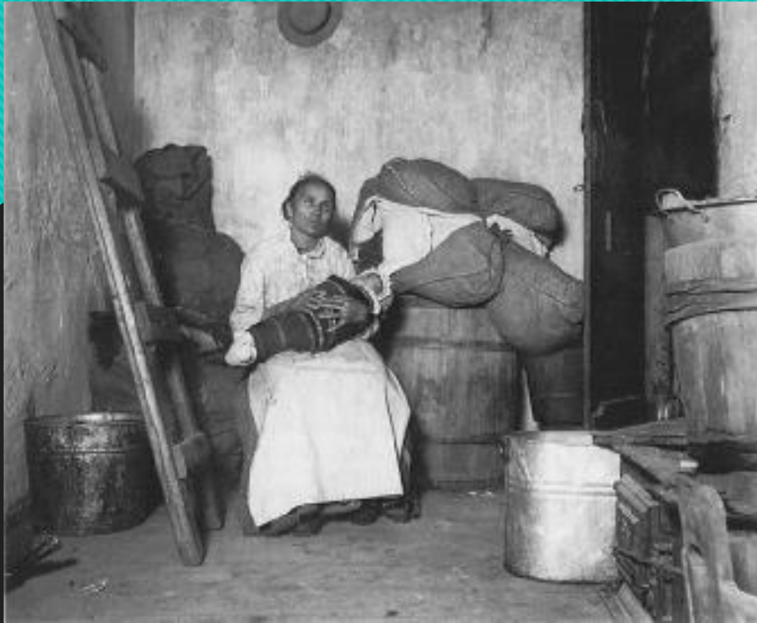
Home of an Italian Rag picker - 1888